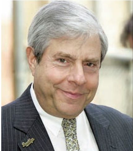
Cultural Enabler, HON. MARTY MARKOWITZ